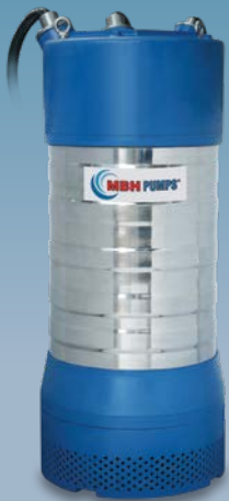
DCAL Series Dewatering Pumps