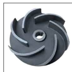
High head dewatering impeller

Actual images of different type of impellers supplied with MBH Waste Water Pumps