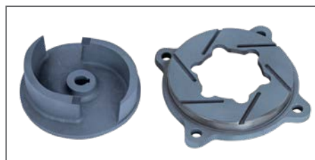
Cutter impeller with cutter casing cover