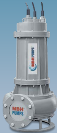
DS Series Duplex Steel Submersible Pumps