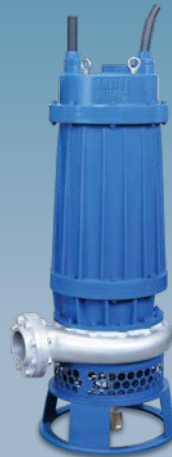
Ni-HARD Series Submersible Slurry Pumps