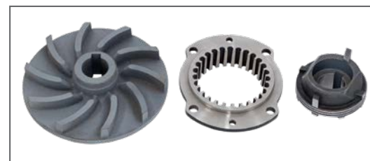
Grinder impeller with cutter