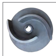
Normal dewatering impeller