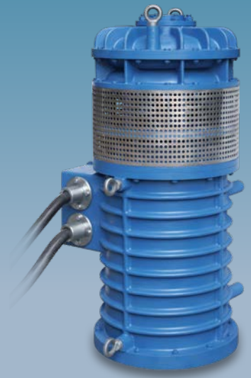
HD Series Dewatering Tough Pumps

Specifications and performance are subject to change without prior notice. Images used are for illustration purpose only.