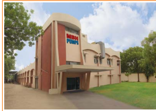
Manufacturing Facility at Ahmedabad (Gujarat) India